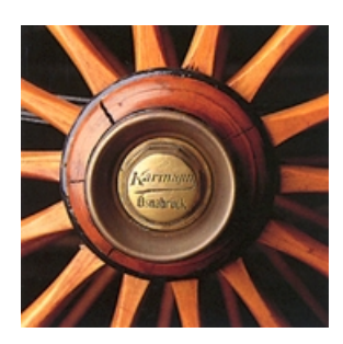
A heterogeneous world

The current Karmann customer list includes Audi (Convertible), Daimler-Chrysler (Mercedes-Benz CLK Convertible, SLK body-in-white module), Jaguar (XK8 Convertible), Renault (Mégane Convertible), and Volkswagen (Golf Convertible).