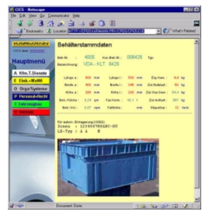
Sample Browser Screens